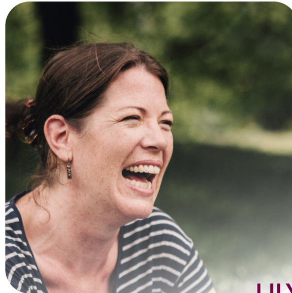
LILY — ROSE

To counter the isolation of seniors until the end of their lives.